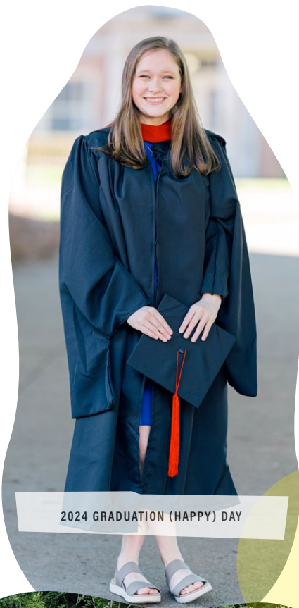
2024 GRADUATION (HAPPY) DAY

We see in God's Word how He uses our weaknesses and brokenness to display His power. He also uses these things to accomplish His purpose through us. God promises to heal the world's brokenness and to redeem us from sin through His Son, Jesus. Jesus brings salvation to all people. Those who repent and believe in Jesus Christ will spend eternity with Him.