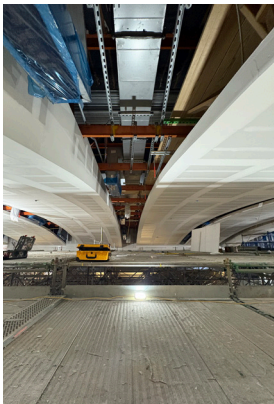
Progress is being made on the arched ceiling.

The renovation of Dawson's Sanctuary continues on schedule so that we will be able to move into the Sanctuary this coming fall. The contractor has progressed from demolition to new construction, and construction is about 50% complete. Much of the work has been in and above the ceiling of the Sanctuary to add electrical, HVAC, sprinklers, and other infrastructure. The Sanctuary is full of scaffolding to create a floor to allow workers to easily access the ceiling and attic. It is anticipated that the removal of scaffolding will start in mid-February.