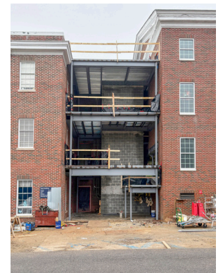
The new elevator tower.

new Sanctuary, pray that God will use this space to help us all become and help others become faithful servants of Jesus Christ. To God be the glory, great things He has done, and will continue to do.