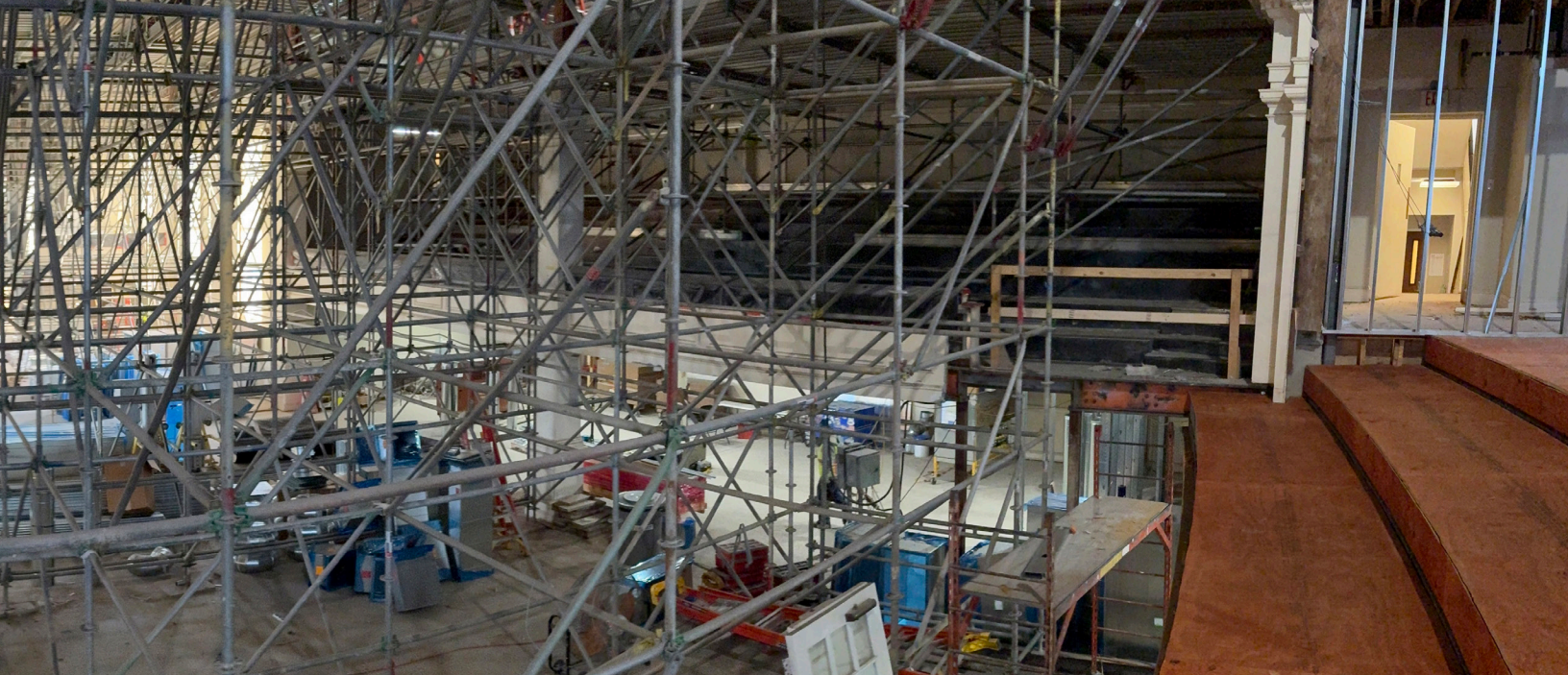
There is still much work to be done, but the choir platform is taking shape.