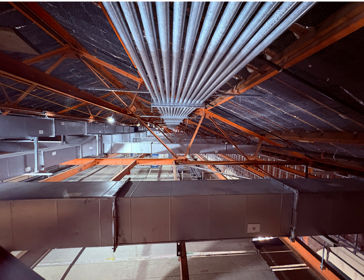
All of the HVAC and electrical work in the rafters have been completed.